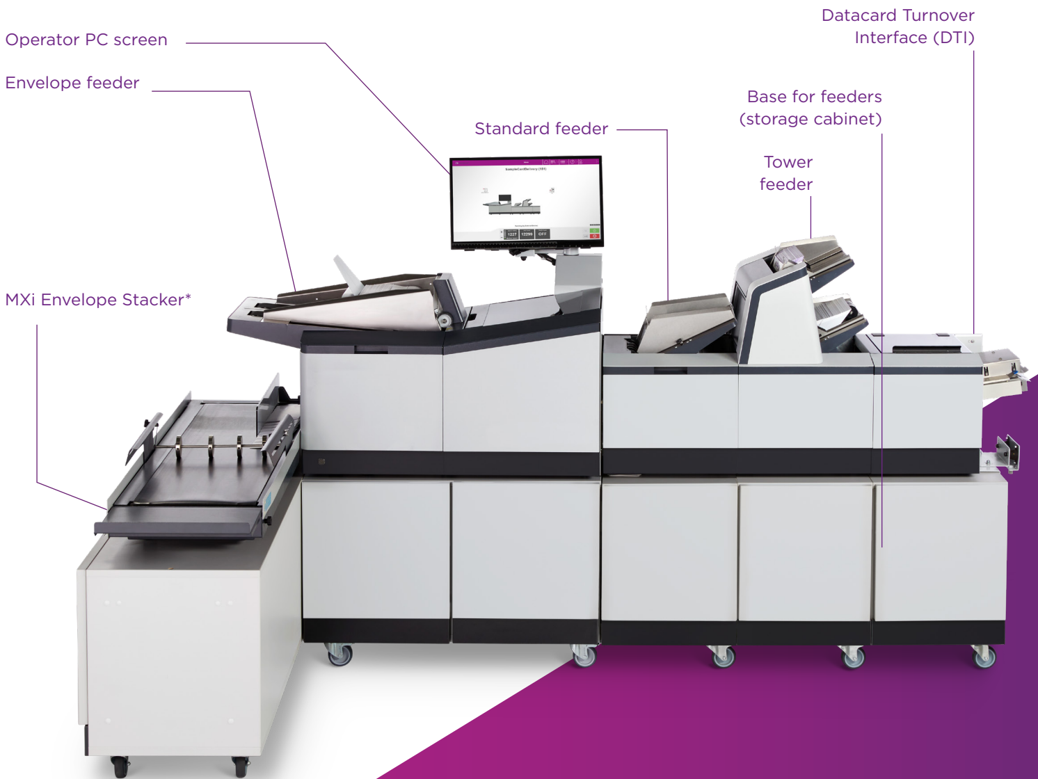
MXi115 Envelope Insertion System